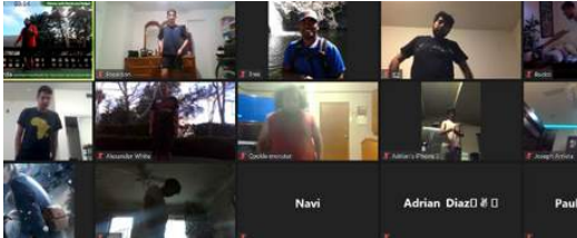
10 Virtual Fitness Activities Between February and March