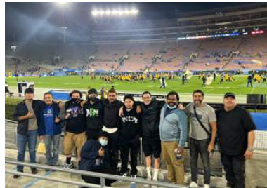
Staff/Alumni Trip to UCLA Football Game