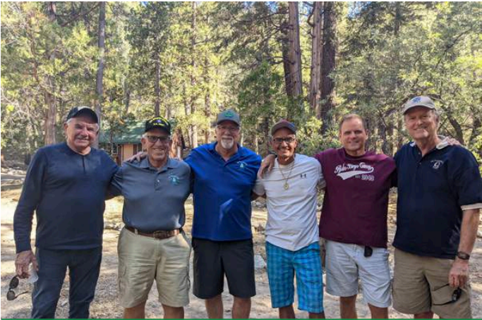
Board of Directors Visited UCLA UniCamp

Thank you to the hard-working staff and volunteers who make possible the Pyles camp program!