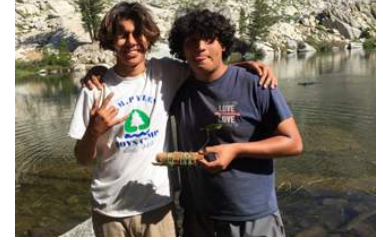
Lioneers and Voyagers:

Our friends at UCLA UniCamp offered us use of their camp facility at Camp River Glen in Barton Flats. 67 Campers signed up and took the bus ride to this beautiful location near Big Bear.