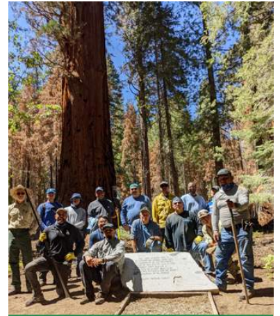
Alumni working with the USFS