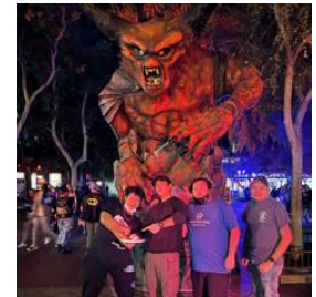
Staff Trip to Six Flags Fright Fest